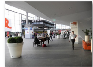
Pianist entertaining the visitors while they are accredited to enter the show

As you enter the complex of 6 very large halls at each of the 3 entry points you find a pianist on a Grand Piano playing to entertain while you are getting your ID recorded and a ticket issued, the main ticket sales foyer is about the size of a typical Australian gun show display area complete with a fountain, a magazine stand where you can freely browse various trade publications, a coffee shop and two areas to leave your jacket and luggage etc. if you wish, as the outside temperature is usually under 5 degrees you need a jacket but the halls are more like 20-25 degrees you need to strip off before walking the halls.