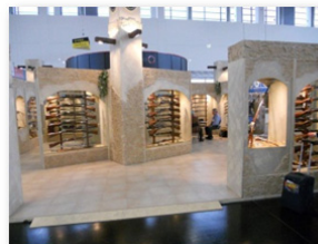
Pedersoli Display 2011 IWA Exhibition

Pedersoli showed their new 1886/71 Lever Action Model rifle available in 45-70 and 444 Marlin, this rifle was displayed with a range of sights including a "Ghost Ring", a standard buckhorn or an attachment for a "Piccatinny Rail" which will accept a wide range of sighting equipment including a long eye relief scope to allow the top eject design to function. This model