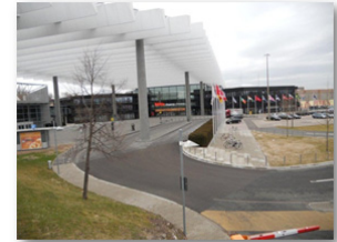
Entrance to IWA 2011 Exhibition

Once again I attended the IWA trade fair held annually in Nurnberg Germany, this is the most important gun trade fair held in Europe each year, although it is dwarfed by the SHOT Show held in USA it suits us better as most of our suppliers are based in Europe and they all come to the Fair to display their new and existing products. Most of our suppliers and indeed many others release their new lines to the World market at the show so it is easy to see the new wares all under the one roof.