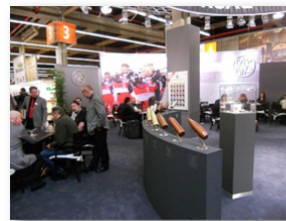
RUAG stand at the 2011 IWA Exhibition

Ruag Ammotec, the makers of RWS and Geco ammunition have widened the range of the popular "Geco" branded (largely Swiss loaded) handgun ammunition, this is their "no frills" line which uses the same metallurgy in the cases but skips the polishing which reduces the price of the product considerably, a number of the RWS ammunition lines have also been reduced in price due to improved production technology and the more favourable exchange rate. They have also introduced a range of lead free rifle, pistol and shotgun ammunition for use in sensitive areas and indoor training ranges, which could be of interest to some shooting clubs and security trainers.