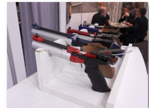
New from Feinwerkbau at the 2011 IWA Exhibition

Feinwerkbau have consolidated their range this year with only minor detail changes to the existing models, they have however introduced a new entry level air pistol the "P11" which is an ambidextrous model aimed at the new pistol shooter or club use. FWB said that they have introduced this model to replace the ubiquitous Model 65 first released in 1954 as they cannot economically continue to make parts for a model out of production for over 15 years. This model should suit the new shooter or the club with older guns which can no longer be maintained.