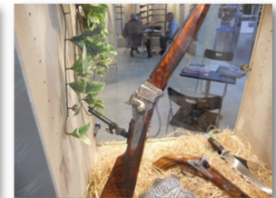
Pedersoli Sharps Deluxe on display at 2011 IWA Exhibition

Also new from Pedersoli was the "Doc Holliday" range of revolvers clearly inspired by the Colt revolver featuring a Birds Beak grip with 4.2" or 5" barrels chambered in 38 Special designed to complement the "Lightning" pump action range now also available in 38 Special specifically for the "Cowboy Action" shooter, this calibre is more pleasant to shoot than some of the more heavily loaded calibres and the revolver is sure to find favour due to its excellent balance and precise trigger system.