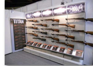
Titan display at 2011 IWA Exhibition

Our supplier Rossler Waffen from Austria has introduced a new catalogue with a wider range of calibres many of which will be of interest to hunters, for smaller feral game 6.5 x 47 Lapua has been introduced and for heavier game .375 Ruger joins the line up, the Titan 3 & Titan 6 rifles are switch barrel design allowing simple barrel switching within bolt face sizes, the hunter can have a range of barrels to suit a wide variety of hunting scenarios.