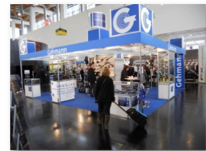
Gehmann display at the 2011 IWA Exhibition

Gehmann, our longest established supplier presented the new Article 560, a micro-Optical device which is fitted between the rear iris and the sight, it sharpens the focus of the front sight and the target, no more blurred front ring and sharp aiming mark (or vice-versa, both are sharp), this device has no magnification so it is legal for all disciplines but you have to look at a target with it to appreciate the improved sight picture, it has taken Gehmann 3 years of research to perfect and patent. Gehmann have over 200 patents for innovations for the target shooter, the company specialises in target shooting and has a well deserved reputation for their products.