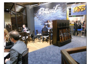
Part of the RUAG Ammotec stand, as this show caters to hunters many visitors bring their dogs, many exhibitors provide food and water for four legged customers.

There is also a new economical line of ammunition probably very suited to practice applications but in Europe dedicated for use in "Cineshot" ranges, these are indoor ranges which are becoming very popular all over Germany among shooters who wish to practice using their favourite hunting guns in a simulated field situation, any kind of hunting (or for that matter military or security training) scenario can be put up on the screen and the shooter can practice shooting their chosen game/targets in a comfortable atmosphere whatever the weather, the Muller Scheisszentrum in Ulm is perhaps the zenith of shooting range design worldwide, have a look at the future at www.mszu.de and wish for a group with deep pockets to set up others like it in Australia. Most feature a decent restaurant with a good standard of food and drink on offer, a far cry from the pies and hot-dogs at local ranges.