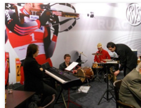
Entertainment at the RUAG Stand 2011 IWA