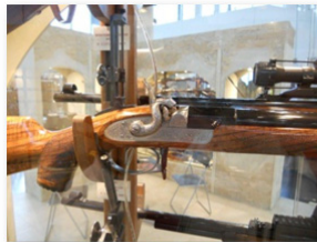
Pedersoli Gibbs Deluxe display 2011 IWA Exhibition

should be an ideal choice for those who hunt in rough country, the 45-70 has adequate power for most hunting in Australia and I would expect it to be of interest to the Sambar hunter or indeed some of the Cowboy action shooters as well for the rifle calibres events.